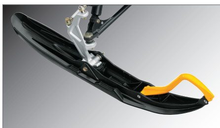
Pilot 5.7 Skis Dual-keel, single runner design for aggressive bites in corners and virtually no darting from the skis.