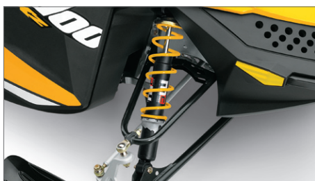
Motion Control Shocks High-quality, high value gas cell shocks.