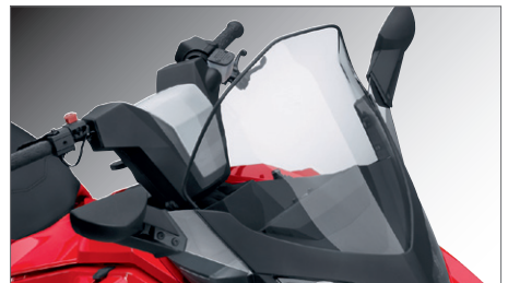
16" Windshield A higher windshield designed for outstanding wind protection.