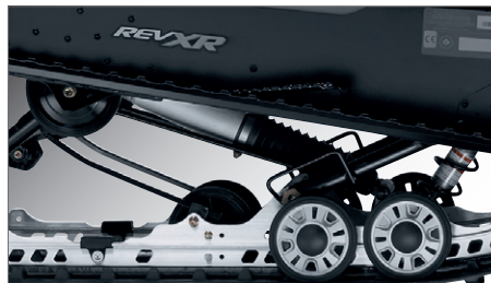
ACS Rear Suspension Customize the ride on the fly with a rocker switch on the handlebars that changes the preload level of the rear shock, for added comfort in varying trail conditions.